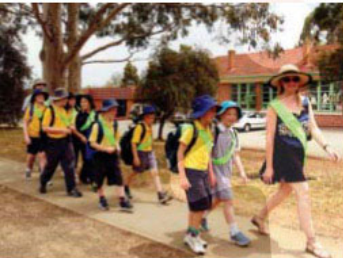
A Walking School Bus in action.